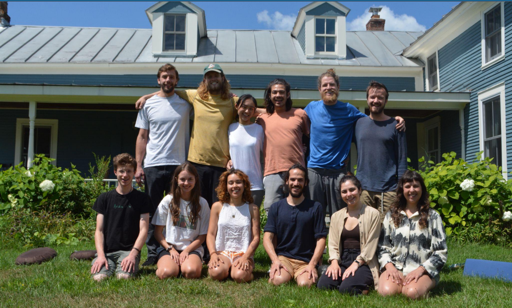
Cohort 2 of the Dharma Gates 2021 Summer Immersion wrapping up their retreat.

We offered two, week-long retreats in a Farmhouse in Enosburg Falls, Vermont. Participants dove deep into the practices of mindfulness meditation, interpersonal meditation, and workshopped ways to support one another in practice and in service to our respective communities. Please see our website landing page for testimonials about participants experiences this summer.